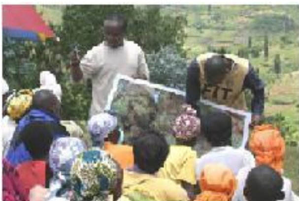
Figure 2: Women participation in process of land adjudication and parcel boundaries demarcation

Women participate in the ongoing process of land adjudication with the use of ortho-rectified aerial photographs and local trained para-surveyors. Women or widow heading households, orphans as well as other land owners (figure 2) guide the surveyor responsible for boundary demarcation, in presences of local leaders. Land rights pertaining to widow, and orphans, being female or male are ascertained at the same level as rights of men and are registered in name of the claimant orphans if there are at age of maturity ( 18 years old or more). In case they are still at minor age, orphans appoint their representative to whom land are registered in presence of local leaders. As stated in the Organic Land Law, when any of those orphans reaches the major age, the registered rights will be transferred to him or her.