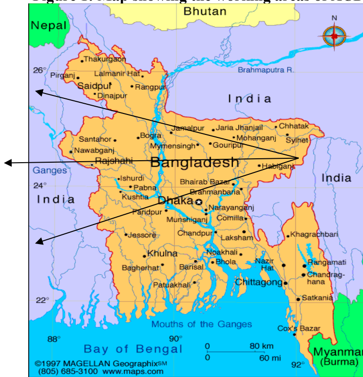
Figure 1: Map showing the working areas of ACD

Three divisions: Rangpur, Rajshahi and Khulna