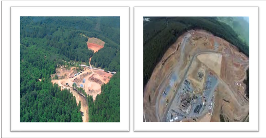
Image 1. Before and After: Cutting the ancient forest to create an open-pit mining site.