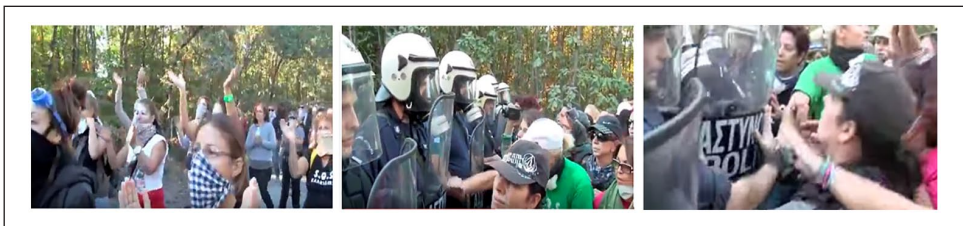
Sequence 5. Women's bodies on the line in the clashes with the police.

https://www.youtube.com/watch?v=ccVrjDoFnVE .