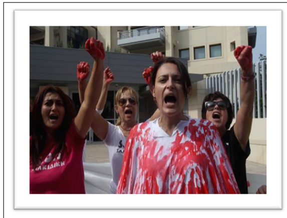
Image 2. Women activists protesting in front of the Canadian Embassy, October 2015.

of a grave and the Marxist ‘salto mortale’ of capitalism as a leap to death (see also Tsavdaroglou et al., 2017). Image 2 shows women’s hands covered in blood in front of the Canadian embassy, and a blog post was entitled ‘Εξόρυξη χρυσού με αίμα λαού’ (‘Extracting gold with people’s blood’). 4 This language was progressively adopted by the entire anti-extractivist movement as an argumentative resource in the anti-extractivist struggle, producing an alternative imaginary that brings together an embodied understanding of nature–society/culture with collective and affective dimensions of being in the world (which is captured by the sequential analysis of images in our visual methodology).