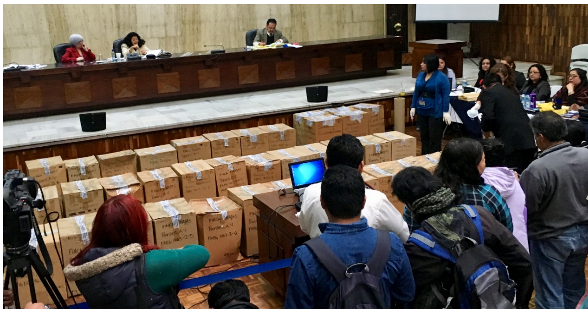
Figure 6: Forensic evidence. Boxes containing the remains of those exhumed from the Tinajas military base were laid out in court on February 11, 2016.

post-mortem data, interviews families of victims, and employs a series of scientific methods decades to locate and identify individuals who were forcibly disappeared or are otherwise to identify mass graves, conduct exhumations, and uses DNA testing and other mechanisms to identify the bodies so that they can be returned to their families for burial. FAFG has a long-standing agreement with the Attorney General's Office of Guatemala to assist in the search for the missing and has exhumed more than 8,000 human remains.