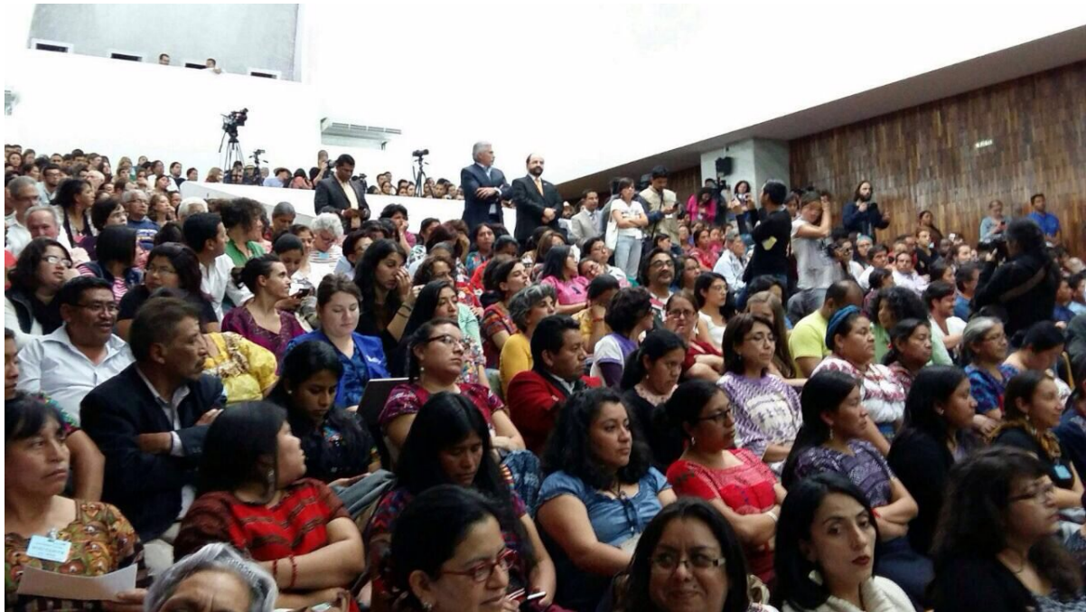
Figure 9: The gallery is packed on the day of the final verdict of the Sepur Zarco trial.

commissioners, who then proceeded to persecute those leaders because of their presumed connection to the guerrilla. 72