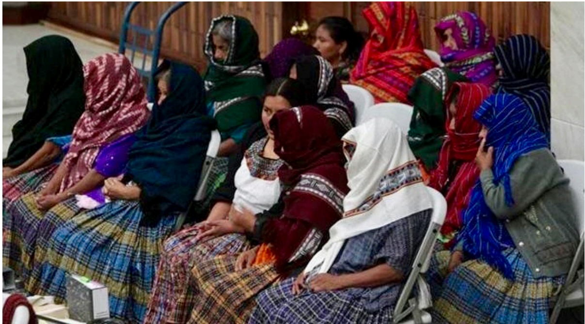
Figure 5: The Grandmothers of Sepur Zarco with their translator.