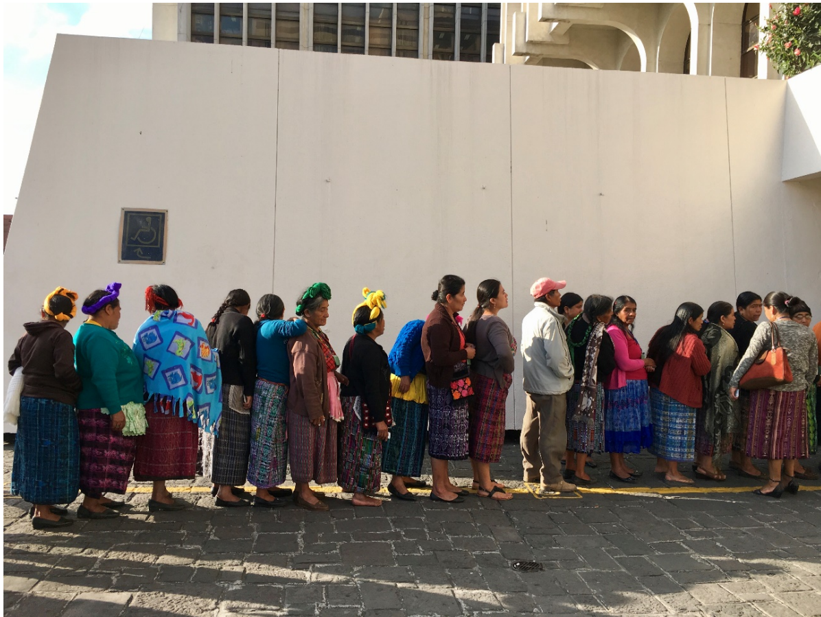
Figure 3: Women-survivors of sexual violence from other regions wait outside the courtroom building to attend the Sepur Zarco trial in solidarity.

courtroom, veiled in their iconic shawls, the crowd burst into applause and began chanting, “Justice, justice!” and “We are all Sepur Zarco!”