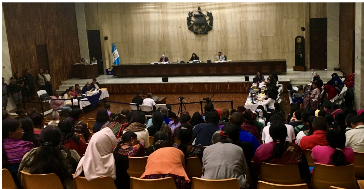
Figure 1: The Sepur Zarco trial; the chamber of the Guatemalan Supreme Court Chamber. Guatemala City.