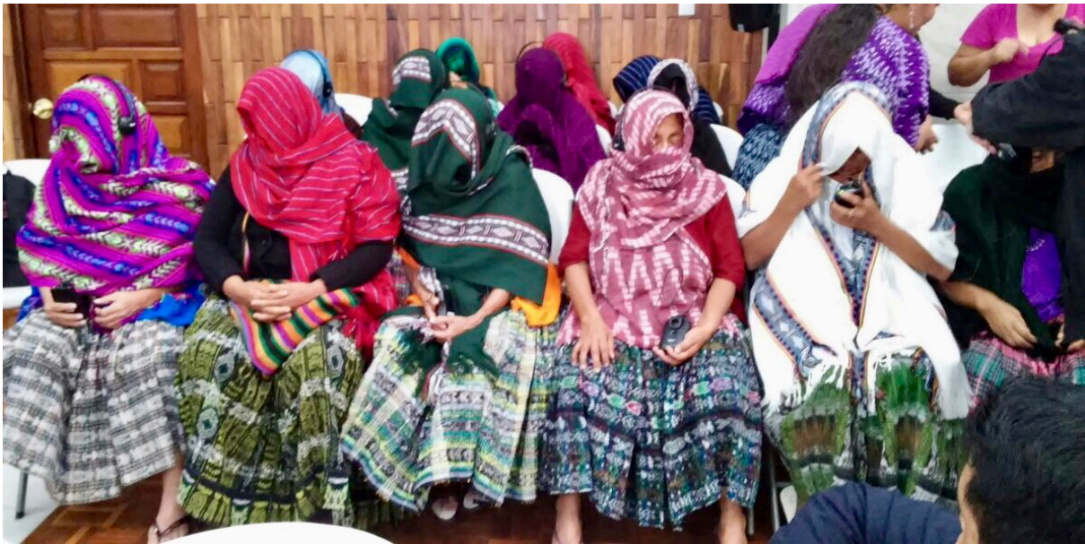
Figure 11: The Grandmothers of Sepur Zarco.

deserving of rights, a category previously denied to them.