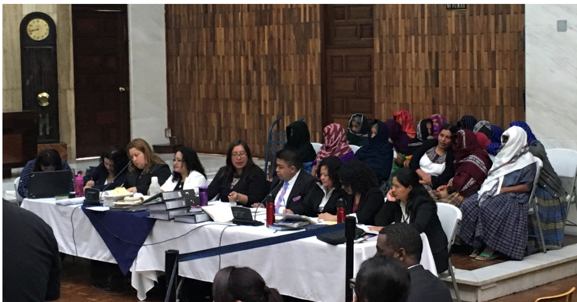
Figure 4: The prosecution team and the Grandmothers of Sepur Zarco.

clothes, and were repeatedly raped, which caused palpable emotional harm”. 12