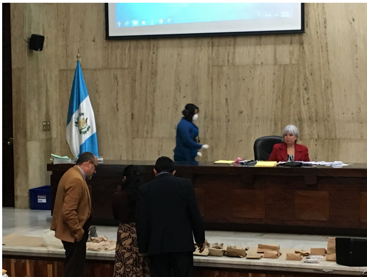
Figure 7: Defense lawyers examine the forensic evidence.

disintegrated over time. 55 The court called upon the FAFG to present the forensic evidence in