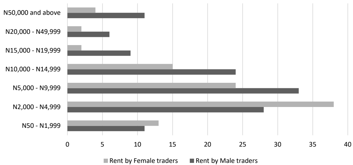
Figure 1 Annual rents paid by female and male market traders