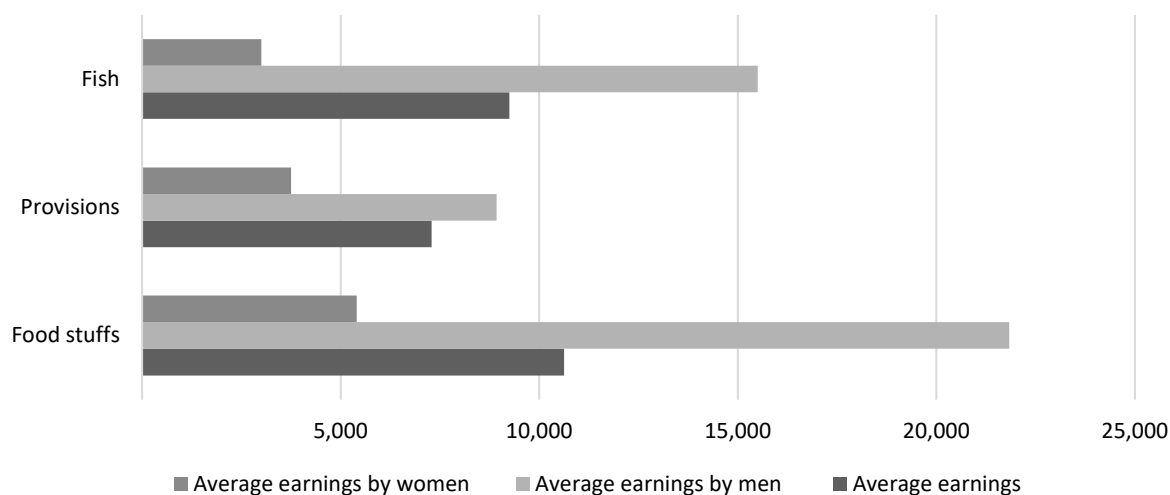
Figure 3 Estimated average weekly earnings of female and male traders by selected product, in naira